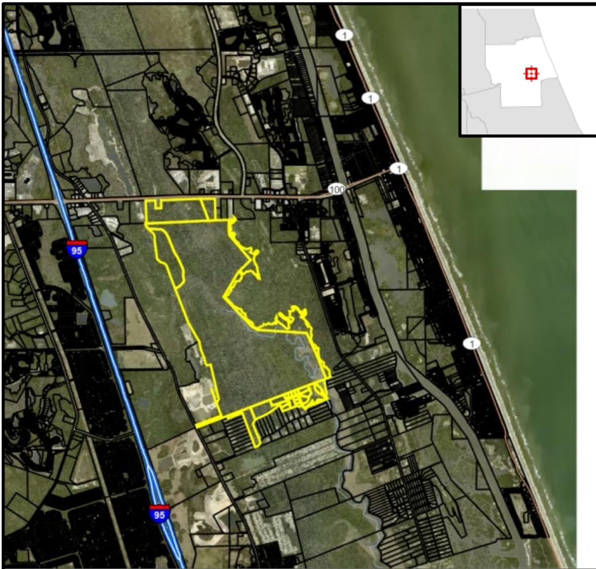
Property Appraiser Aerial Photo

OVERVIEW/SUMMARY: This request is quasi-judicial in nature (not legislative) and does require disclosure of ex parte communication. This request is for approval of a Public Use within the PUD (Planned Unit Development) and AC (Agricultural) zoning district for a regional park. The property is located at State Road 100, Old Kings Highway, and Bulow Creek and is 1,185+/- acres in size.